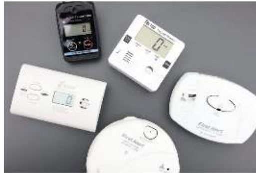
An array of portable carbon monoxide monitors, which range in cost from $20 to $200 and have different levels of sensitivity.