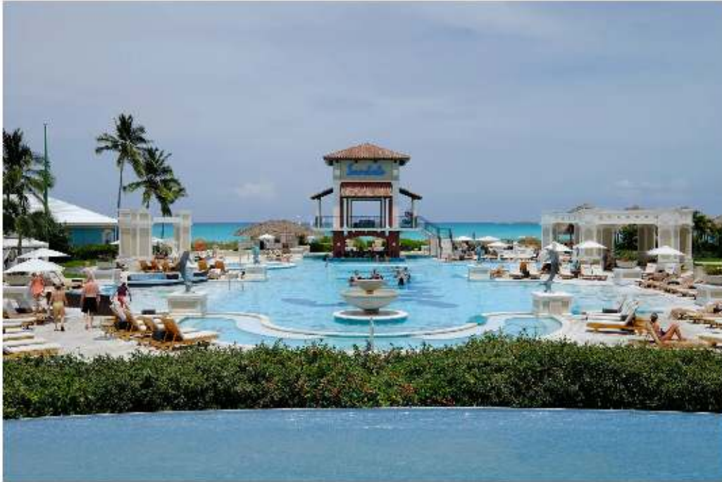
The Sandals Emerald Bay resort recently had a carbon monoxide leak that killed three people and injured a fourth.

regulators to mandate detectors in those cases. Inexpensive models that do not require them. Airbnb offers hosts free detectors, but in a 2018 study, public health researchers found that only 58 percent of hosts said they had installed them.